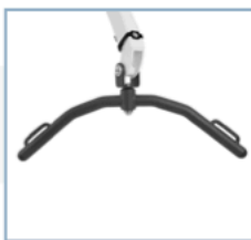
Hanger bar 360° rotating, for loop sling attachment