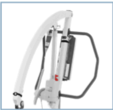
Grip handles large, easy to grip, for easy maneuverability