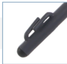
Sling 2-point attachment to hang sling with loops