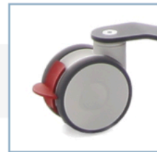
2 castors with brake brakes on the rear wheels prevent the device from moving during use when necessary