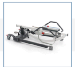
Compact dimensions the lift can be folded down for easy storage