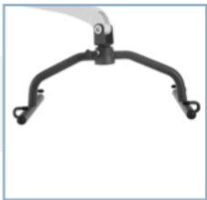
Hanger bar 4P 4-point

Levitop Standard with hanger bar 4P (electrical leg adjustment)