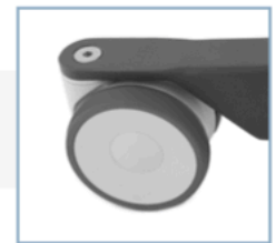
2 smaller wheels