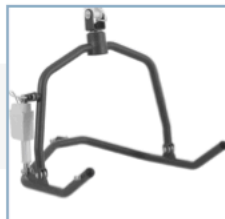
Hanger bar 4ESB 4-point