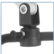
Hanger bar lock in version Standard