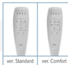
ver. Standard ver. Comfort