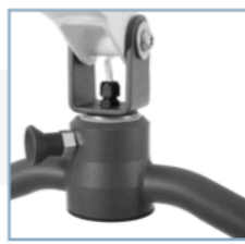
Hanger bar lock in version Comfort