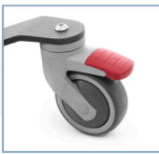
2 castors with brake brakes on the rear wheels prevent the device from moving during use when necessary