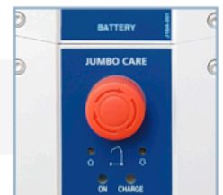
Emergency stop button