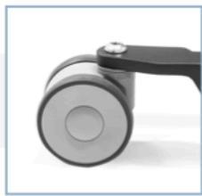
2 smaller wheels