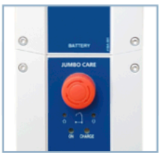
Emergency stop button