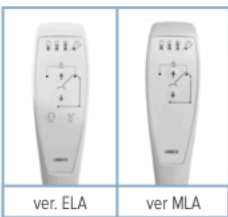
Remote control ergonomic and easy